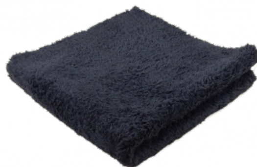
A soft buffing cloth