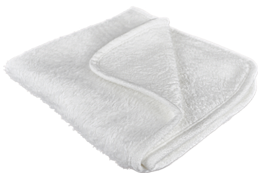
A soft cleaning cloth