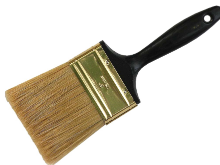
A clean paintbrush