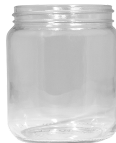
An empty wide-mouth jar or container