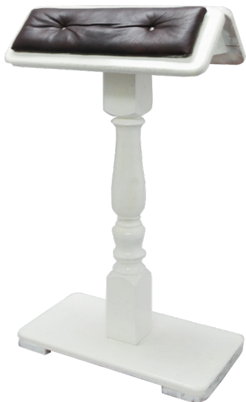
A saddle stand or rack that safely holds your saddle.