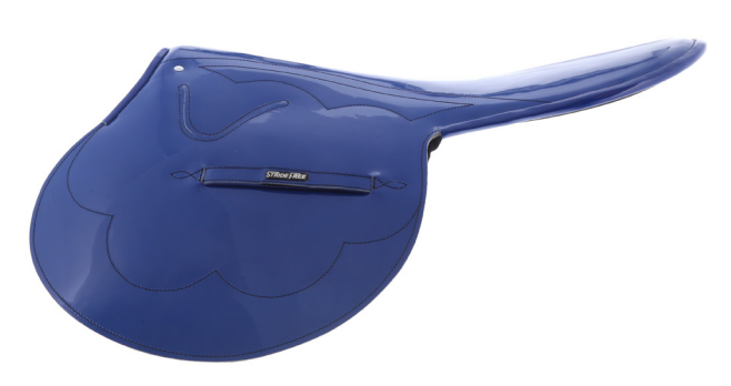
Forward cut flap option available