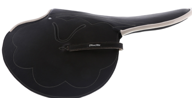
Forward cut flap option available

LEATHER Patent Leather, Full Grain Leather