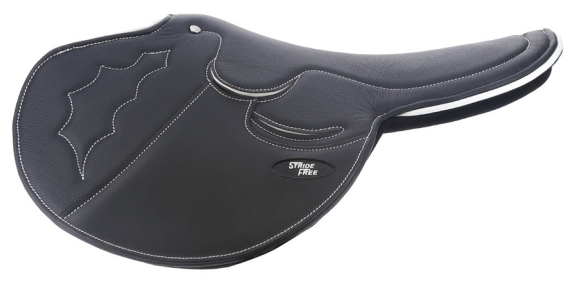
Available only in Australia