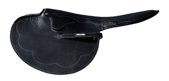
Forward cut flap option available