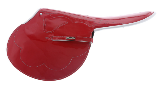
Forward cut flap option available

LEATHER Patent Leather, Full grain leather